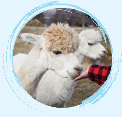
Farm Tours & Petting Zoo