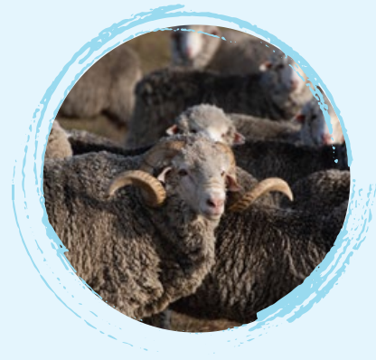
Mt Hay Station