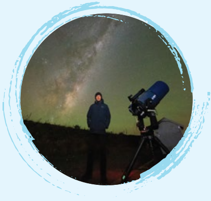
Silver River Stargazing